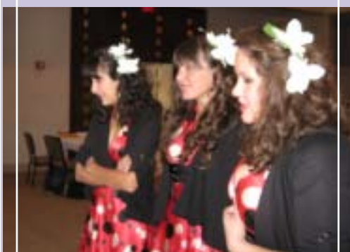
The entertainers known as The Hummingbirds looking at actual photos of servicemen at JCC dances in Providence during WWII. They performed ala The Andrews Sisters.