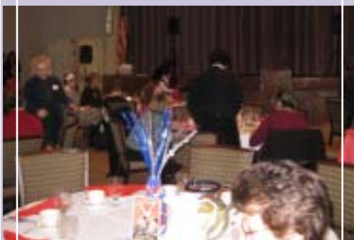
The Meeting Hall decorated in a 1940's WWII theme