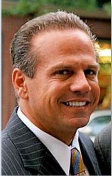
Congressman David Cicilline